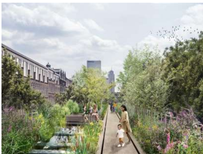
Figure 3. Hofbogenpark: Rotterdam's newest green landmark

Netherlands: Many Dutch cities are leading the way in water-related landscape solutions. For example, in Rotterdam’s Hofbogen mountain park (on a disused railway line) (Figure 3), rainwater is filtered through natural filters and stored in the aquifer; in droughts, it is used to irrigate plants. “Rotterdam is at the forefront of the cluster: it is an international leader in sustainable water management.” In Amsterdam, the IOOR has developed an integrated design method for heat reduction and flow management in its municipal buildings. In general, Dutch cities demonstrate “integrated partial-delta solutions” in water management and green landscape design.