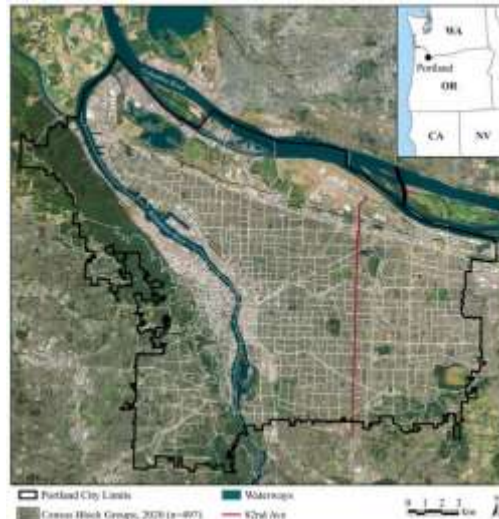
Figure 4. Evaluating Urban Green Space Inequity to Promote Distributional Justice in Portland, Oregon

USA: In the USA, cities such as Portland (Oregon) and New York are leaders in sustainability. Portland was the first city to introduce a green belt in 1973 to limit urban growth (Figure 4), which prevented the city from developing too quickly . Later, projects such as “Green Streets” and “From Ashes to Green” were implemented, which led to the installation of more than 900 bioswales and 398 green roofs throughout the city, and over 32,000 streets were landscaped with trees. New York City, meanwhile, adopted the PlaNYC strategy in 2007, initiating an environmentally responsible approach. The Green Infrastructure plan, developed in 2012, opened more than 300 hectares of new parkland (e.g., the High Line, the Hudson River Park expansion); planted more than 500,000 trees; and implemented 257 “green street” projects. These examples show that green infrastructure (transportation corridors, urban ecosystems) is also being widely used as a means of enhancing sustainability in leading US cities.