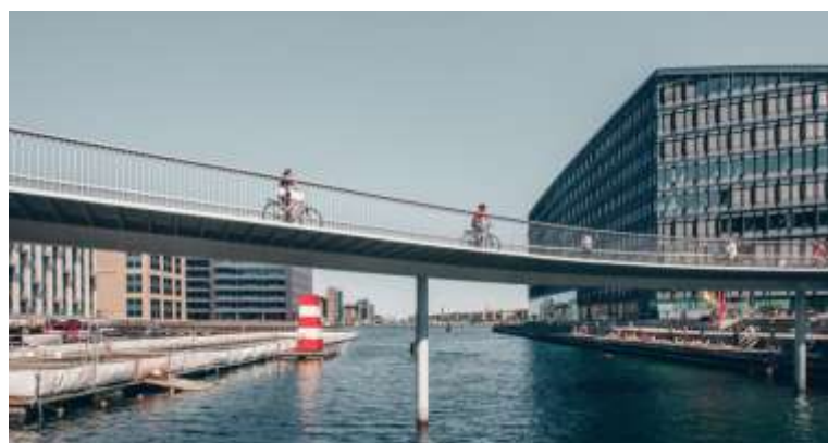
Figure 2. Copenhagen’s famous Cykelslangen (Bicycle Snake) bridge is an example of the city’s focus on elevated bike lanes.